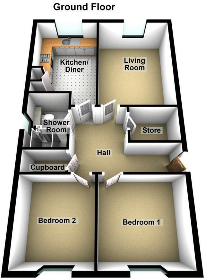
1 Etonhurst, Malvern